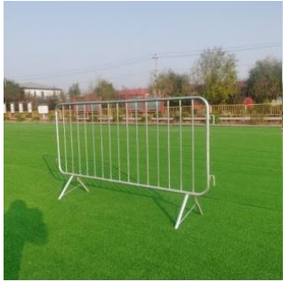
welded fixed feet